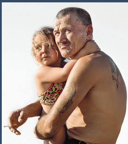
Anonymous, Bakersfield, CA