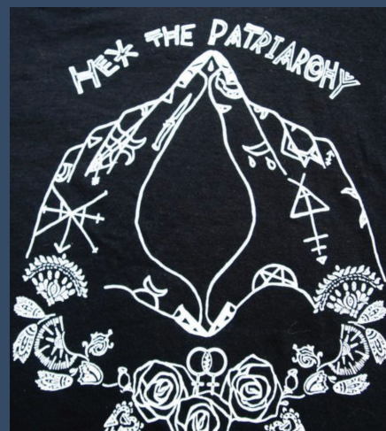
Hex the Patriarchy