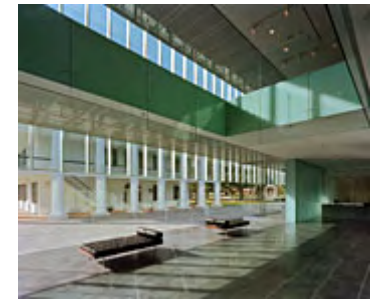
Paul & Lulu Hilliard University Museum in Lafayette, LA