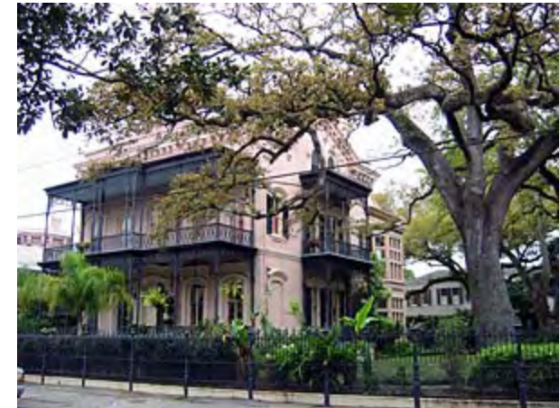
The Garden District in New Orleans